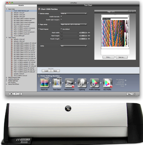
i1iSis 2 and i1 Profiler: Speed and ease of use combined